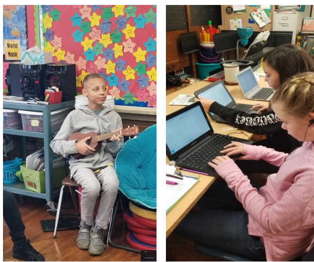
Great Job 5th Graders